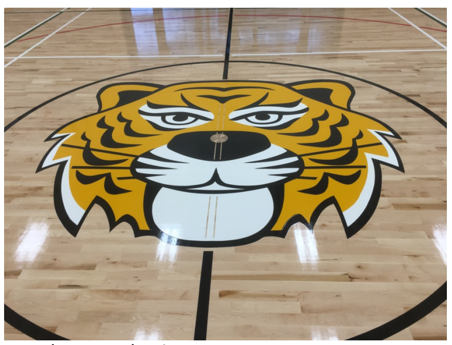
Tenny (our mascot) in the gym