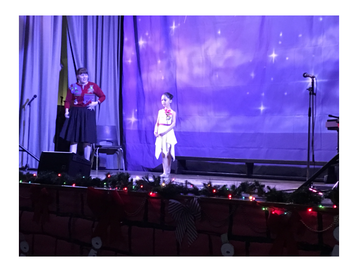
Arita (Gr 3) dancing