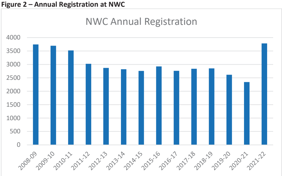
Total annual registration (July 1-June 30) at NWC.

Driven by this jump in immigration, September 2022 enrolment increased by 1,204 students or 2.5% in comparison with September 2021, which is the first substantial enrolment increase for the VSB in many years. Overall, enrolment this year is about the same as enrolment was in 2017.