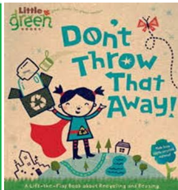
By Lara Bergen